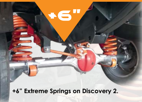
+6" Extreme Springs on Discovery 2.

Our Extreme brake lines are made from top quality stainless steel fittings swaged directly onto a hard drawn tensile stainless steel braided Teflon hose.